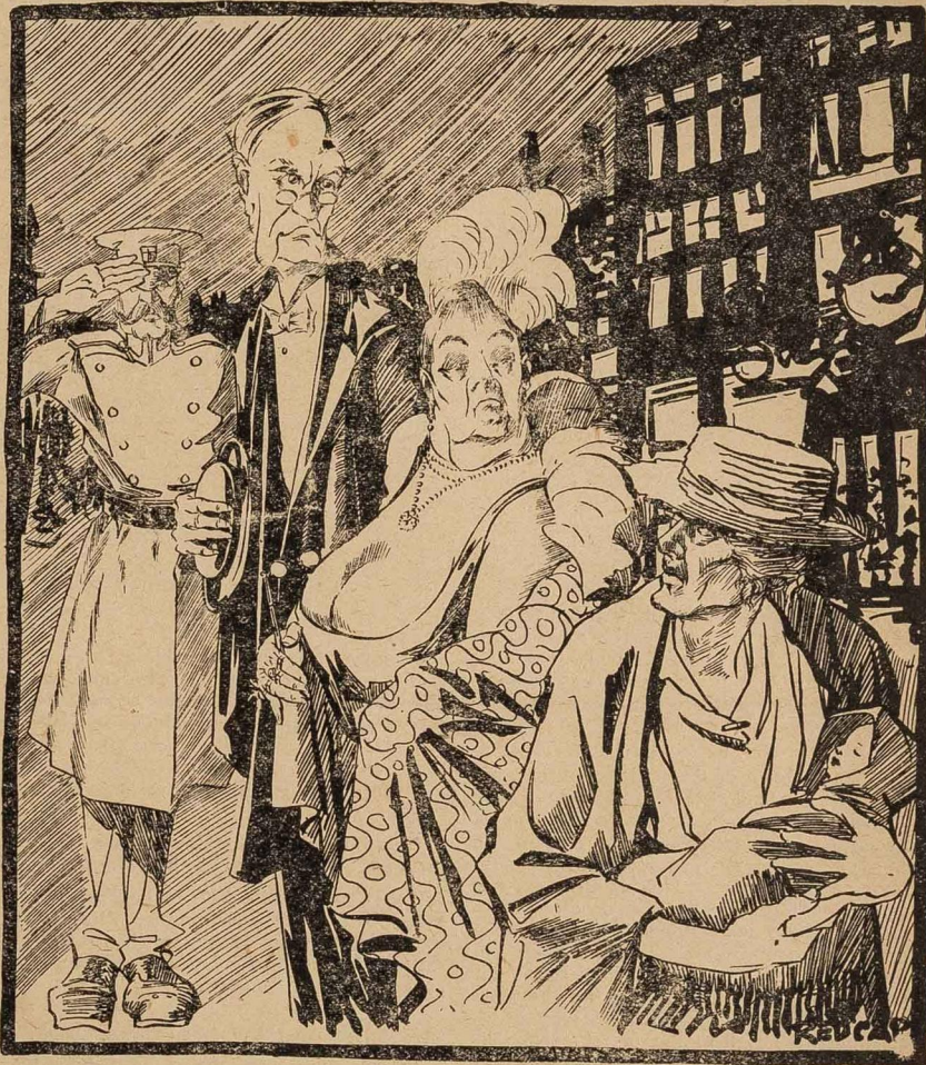
"The London Season."

Mr. Snowden, in this opening chapter, decides against the argument that the evils of the capitalist system can be, and are being, eliminated. He urges that "for a decade before 1914, there had been no advance in the conditions of the working class as a whole. On the contrary, wages had declined and the cost of living had increased." In 1854 the average cash wage of the agricultural worker was 10s. 8d., in 1908 it was 14s. 7½d. In the